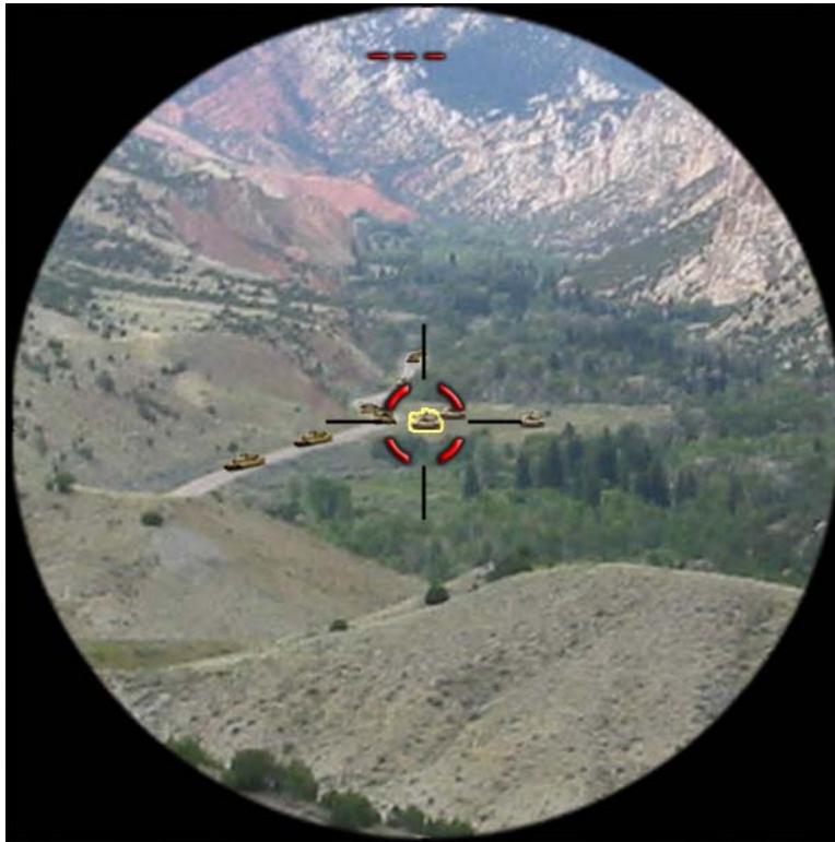
ON TARGET, STRONG SIGNAL

Figure 5 – The JTAC can change the upper display to indicate signal strength. Three bars indicate a strong signal. The signal strength can be useful in verifying output of JTAC ground laser designators.