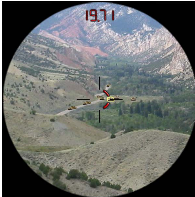
CLOSE DIRECTLY RIGHT, PRF=19.71Hz

Figure 3 – The JTAC moves the FOV to the right. As the target reaches center, SPOTTR switches to inner circle indicators which indicate the cross hairs are close to the laser spot.