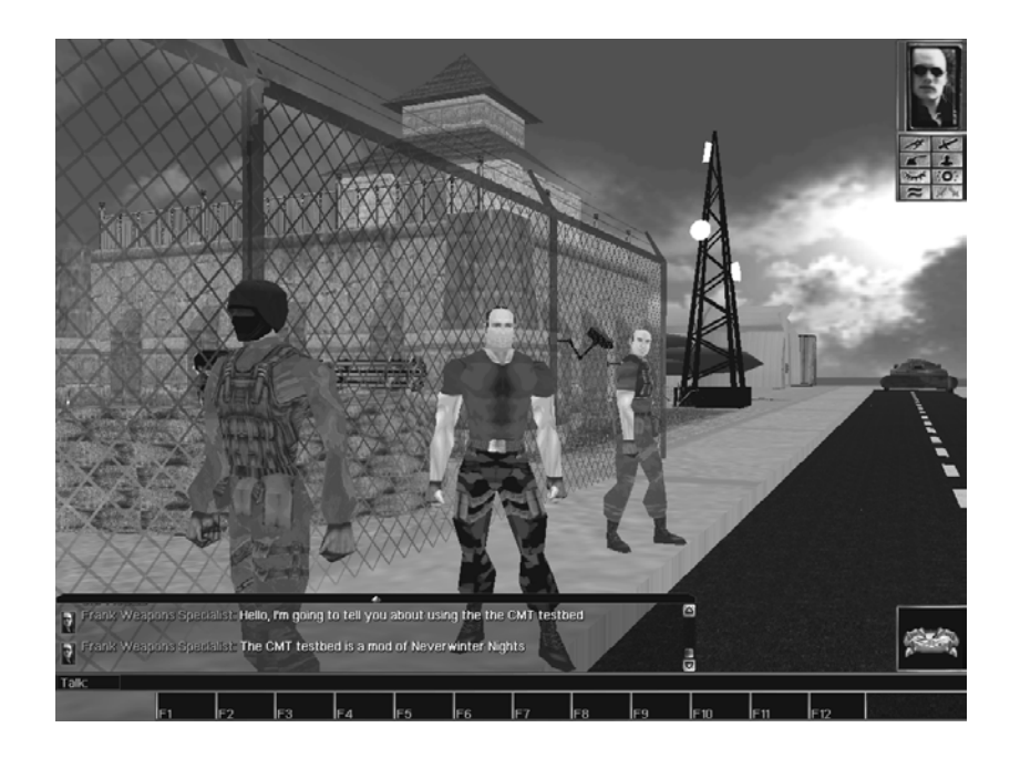
Figure 1. Screenshot illustrating the game-based testbed

The game-based testbed provides an immersive environment in which participants' actions and behaviors can be observed, and related data can be collected automatically. In the experimental scenarios, game play can range from fairly linear and well constrained to much more open and unconstrained, allowing the experimenter to have extensive control over the behavioral latitude available to participants. For more information on the game-based testbed, see (Warren, Sutton, Diller, Ferguson, & Leung, 2004). The tool is scheduled to be delivered to the LTAMC team at the June 2005 planning meeting.