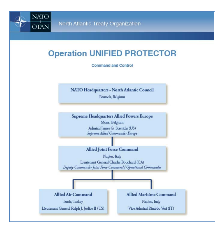
Figure 2. Operation Unified Protector Command and Control

NATO Allied Air Command, located in Izmir, Turkey, coordinated the initial air effort in February 2011 through early March 2011 under the direction of the Supreme Allied Command in Belgium. Command of the maritime and later the overall Allied Joint Forces Command operation, including the air command, was run from Joint Forces Command in Naples, IT. The overall coordinating effort rested in Belgium at Supreme Headquarters Allied Powers Europe, with Admiral James Stavridis (US) in command. (See Figure 2) Following a United Nations mandate to protect civilians, NATO began bombing military targets in March 2011. NATO was already present in the Mediterranean (2001) under Operation Active Endeavour, making it relatively easy to turn on Operation Unified Protector, NATOs operation enforcing UN mandates 1970 and 1973.